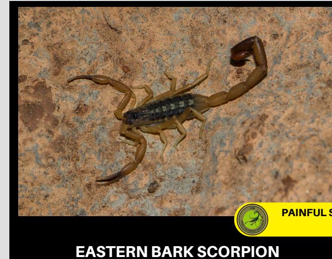
EASTERN BARK SCORPION