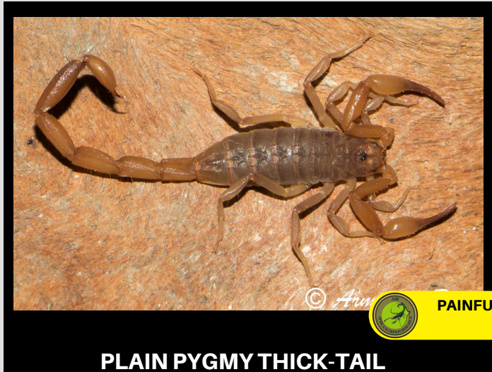
PLAIN PYGMY THICK-TAIL