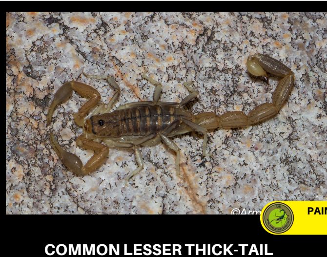
COMMON LESSER THICK-TAIL