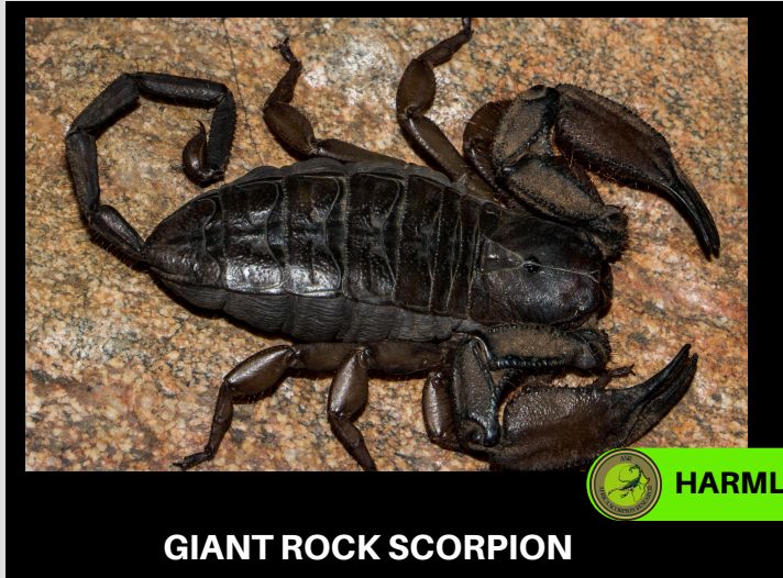
GIANT ROCK SCORPION

https://africareptileconservation.com/africa-scorpion-research-asr.php